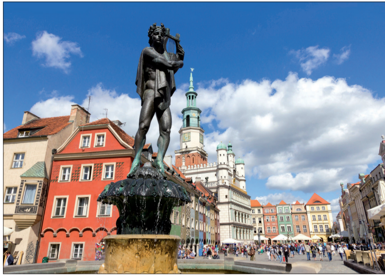
Poznan – Old City