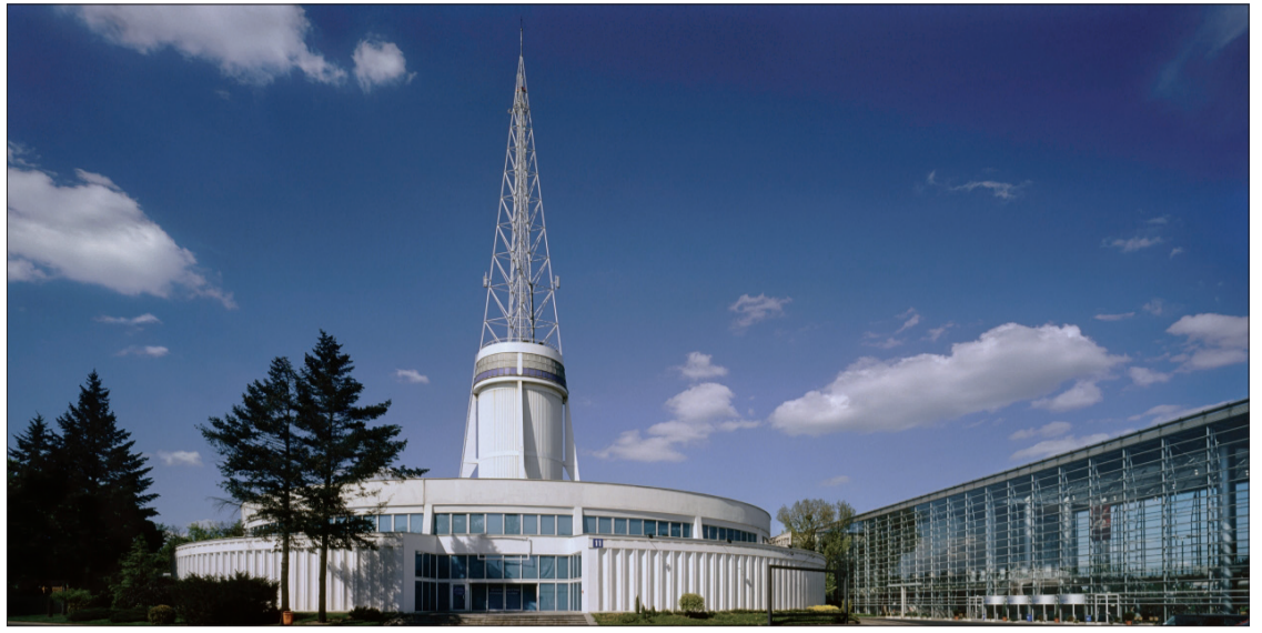
MTP, Poznan International Fair – venue of FDI 2016 Poznan